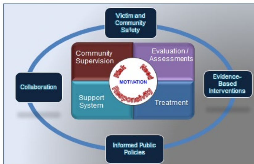
Treatment, Engagement, Assessment, Management and Supervision (TEAMS) Model

5.005 TEAMS is an acronym for Treatment, Engagement, Assessment, Management and Supervision. 134 This model guides the CST members to work collaboratively with each other to assist the client/offender in becoming a pro-social, productive member of society, and in order to enhance community safety. The foundations of the model are Victim and Community Safety, the use of Evidence Based and Research Informed Practices, Informed Public Policies and Collaboration.